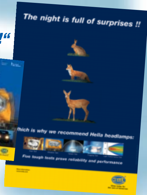
The keyvisual of the international Lighting Campaign 2004.

With the Lighting Campaign 2004 Hella is also starting an added value campaign based on the two added value components quality and support. This is our asset and is what makes us stand out from other suppliers. It is the "plus" that makes Hella partners successful!