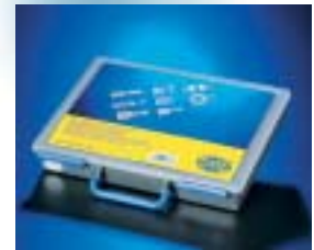
Crimp connector set, non-insulated 8KW 009 255-801