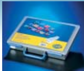
ATO/Mini flat fuse set 8JS 009 257-801

The versatile Handy-Box was developed as a practical accessory: for storing and transporting four set cases at the same time. It can also be attached to the wall as a shelving system. The boxes can be fixed together side by side. Empty cases, case inserts, installation and service parts can be ordered individually at any time.