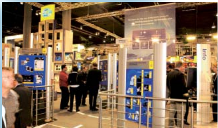
Area Sales Support for all target groups