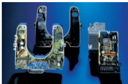
Various control units for fuel-fired air heaters