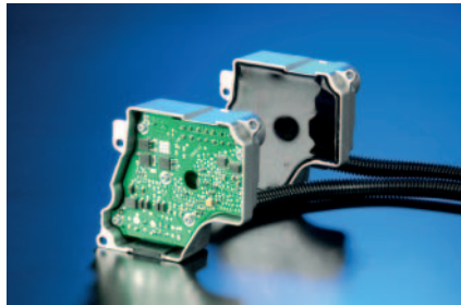
Control unit for fuel-fired supplemental heater

Supplemental heaters are used primarily on engines designed for optimized fuel consumption. They are required to compensate the heat deficit that occurs with such engines during cold weather and are used to pre-heat the cooling water. In such situations, the supplemental heaters allow the vehicle passenger compartment to be heated quickly. The control units are designed to meet specific customer requirements, allowing them to be optimally integrated into the heater.